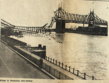
Bridge in Manhattan after mishap.

The terrifying incident took place almost exactly an hour after the start of the 26-mile, 35-yard endurance test, which began on Staten Island and proceeded through parts of Brooklyn and Queens before reaching the bridge. As the head of the 10,000-strong pack reached the Manhattan end of the