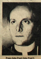
Pope John Paul John Paul I

Only hours earlier the popular Pontiff had told his closest aides that he wanted to be called Jay-Pee Two, as a symbol of the informality and bold change that he hoped would mark his reign.