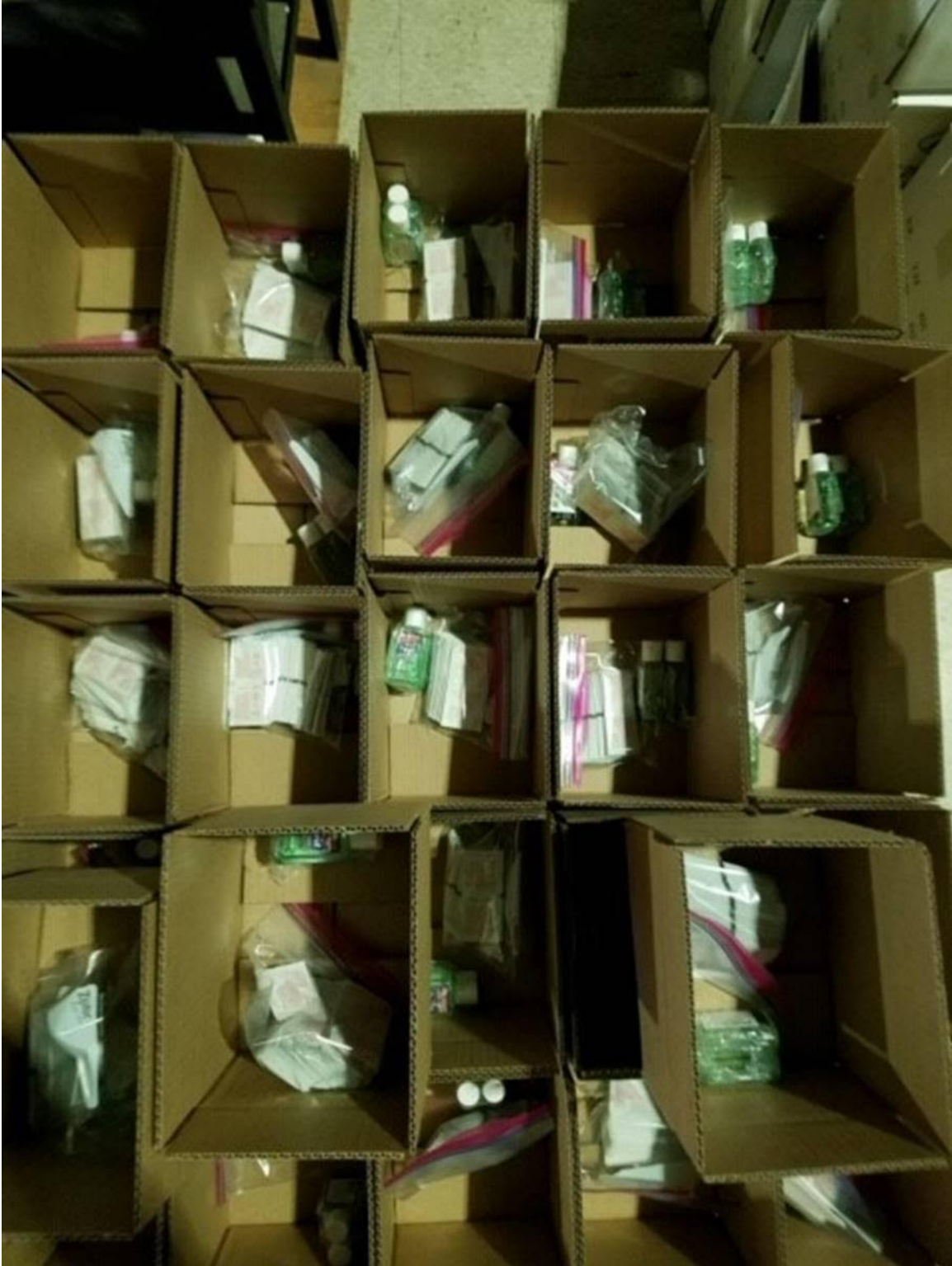
This April 10, 2020, photo, shows care packages assembled in AP's warehouse facility in Cranbury, N.J. Over the past few weeks, the team has packaged and shipped 246 care packages to the homes of staff and to bureaus. In between shipments, nearly 300 gallons of hand sanitizers are being poured into smaller bottles for distribution.