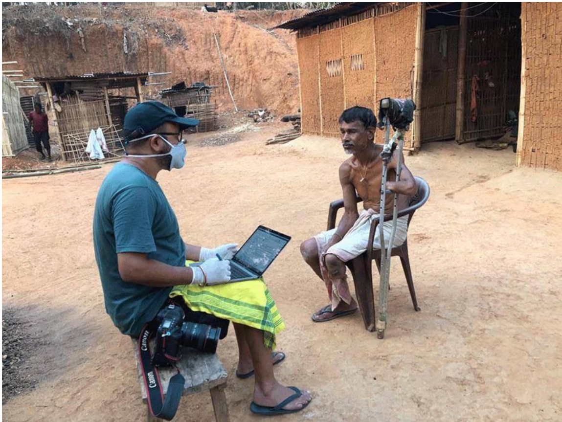
Photographer Anupam Nath interviews a Jayantipur villager 40 miles outside of Gauhati, India, April 14, 2020.