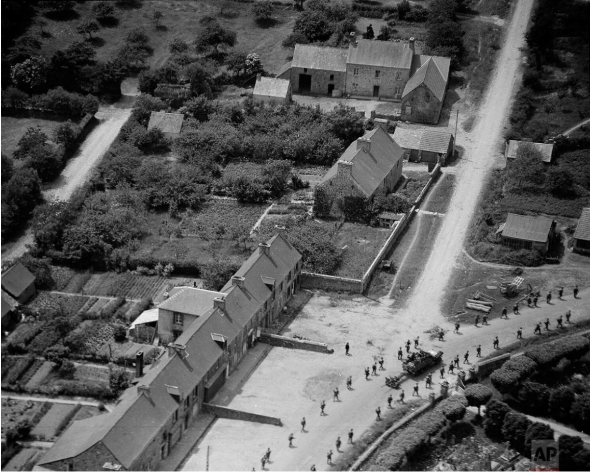
American troops move through St. Jacques de Nehou, France, en route to Barneville and Carteret on the west coast of the Cotentin peninsula, during the operations leading to the capture of the port city of Cherbourg, June 27, 1944.