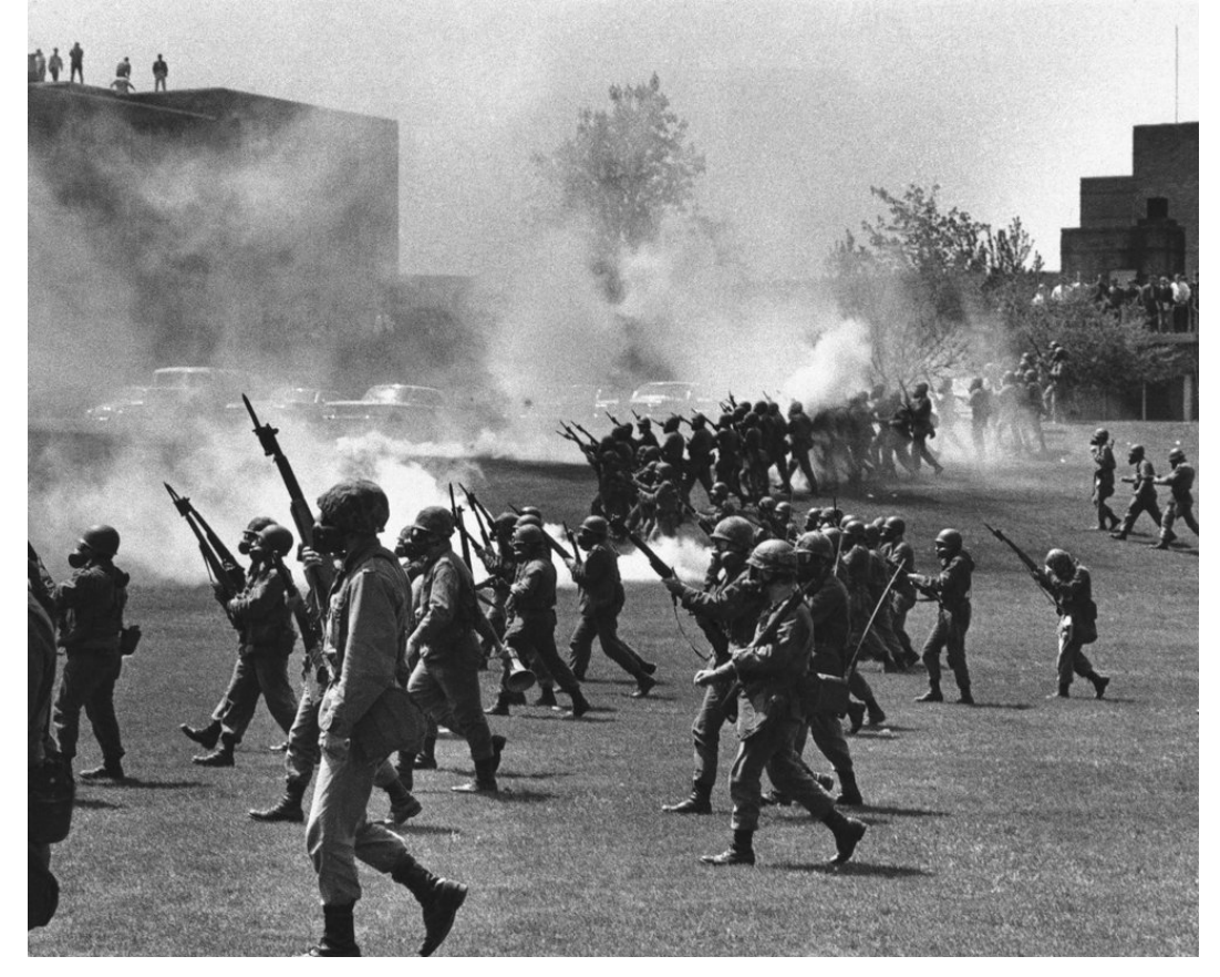
FILE - In this May 4, 1970 file photo, Ohio National Guard soldiers move in on war protestors at Kent State University in Kent, Ohio. Four persons were killed and multiple people were wounded when National Guardsmen opened fire. The school, about 30 miles southeast of downtown Cleveland, had planned an elaborate multi-day commemoration for the 50th anniversary Monday, May 4, 2020. The events were canceled because of social distancing restrictions amid the coronavirus pandemic. Some events, activities and resources are being made available online.