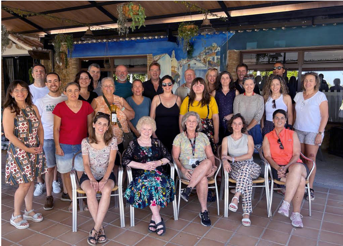
Group photo of teachers, students and staff at the Pueblo Ingles weeklong Spanish immersion program in Torres, Jaén, Spain. We took over the entire Hotel Rural Puerto Magina on the mountainside overlooking the village of Torres.